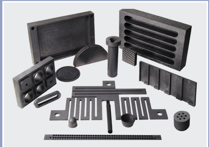
GRAPHITE CNC MACHINING