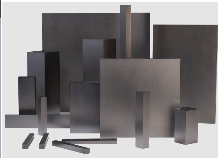
GRAPHITE BLANKS, PLATES, SHEETS, BLOCKS