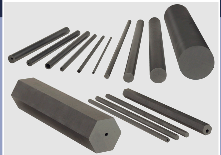
GRAPHITE ROUNDS, TUBES, HEXES